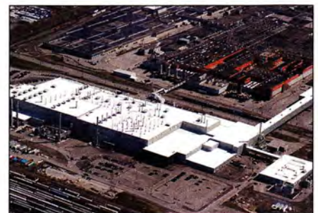
Dean-Chandler employees have installed Sarnafil roofing systems at Maple Leaf Gardens (left), the Sky Dome in Toronto (center), as well as Rogers Centre, Ford Canada in Oakville, and General Motors in Oshawa.