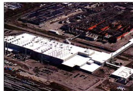
Dean-Chandler employees have installed Sarnafil roofing systems at Maple Leaf Gardens (left), the Sky Dome in Toronto (center), as well as Rogers Centre, Ford Canada in Oakville, and General Motors in Oshawa.